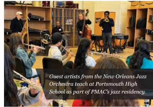
Guest artists from the New Orleans Jazz Orchestra teach at Portsmouth High School as part of PMAC's jazz residency.