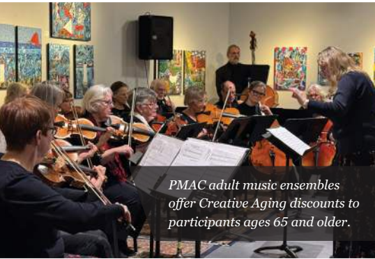
PMAC adult music ensembles offer Creative Aging discounts to participants ages 65 and older.