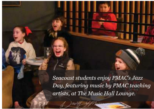
Seacoast students enjoy PMAC's Jazz Day, featuring music by PMAC teaching artists, at The Music Hall Lounge.