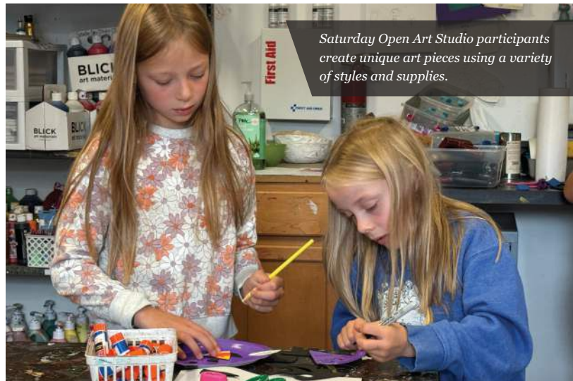
Saturday Open Art Studio participants create unique art pieces using a variety of styles and supplies.