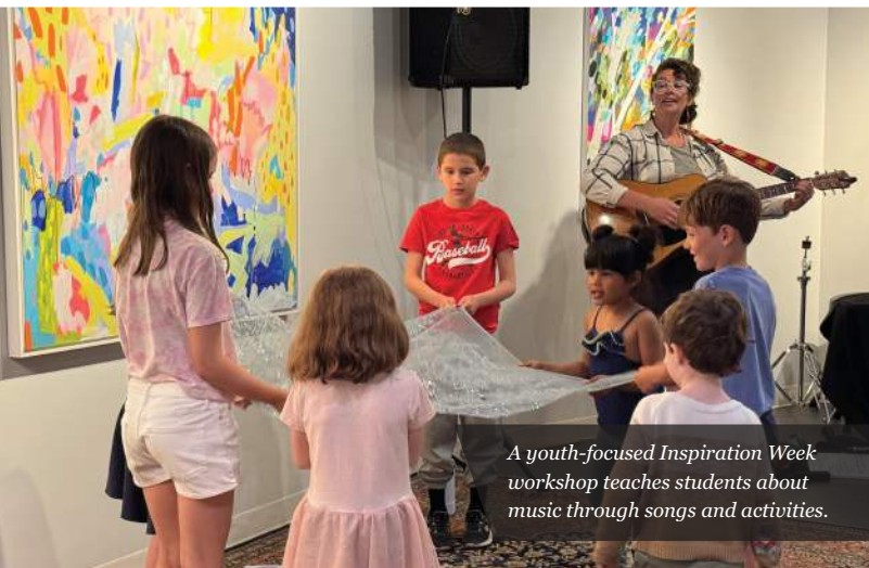
A youth-focused Inspiration Week workshop teaches students about music through songs and activities.